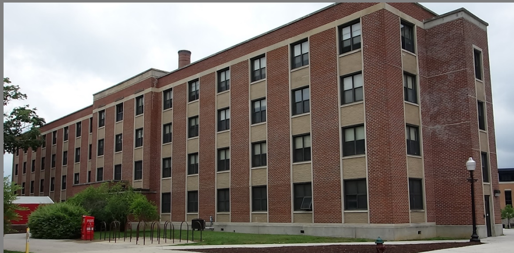
South and East Elevation