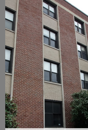
Exterior Masonry (South)