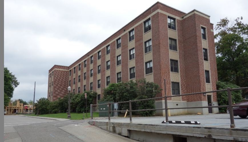
North and West Elevation

Demolition of Thomas Hall, Building 0012