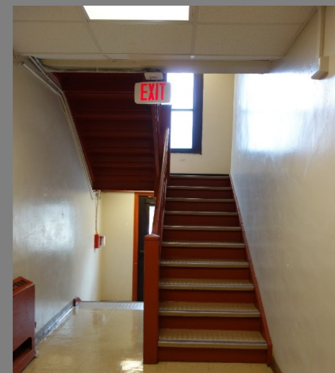
East End Stairwell

Demolition of Thomas Hall, Building 0012